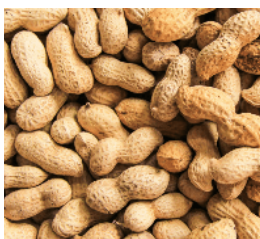
Peanuts 5 / 10 kg sack or box

FRESH VEGETABLES & FRUITS with standard packaging sizes