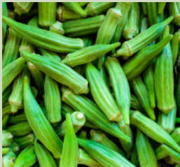
Okra 4 / 5 kg box