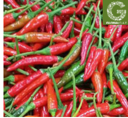
Red Chillies 2 / 5 kg box