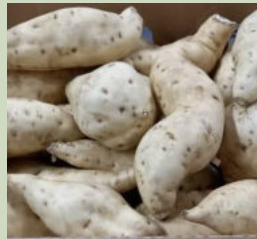
Sweet potato 8 / 10 kg box