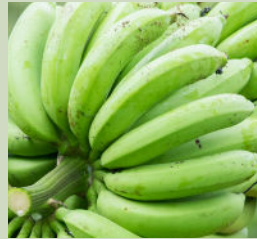
Matooke 8 / 10 kg box