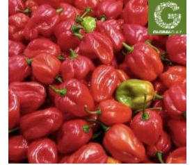
Red Habanero 4 / 5 kg box