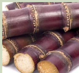
Purple Sugar cane 10 kg box

FRESH VEGETABLES & FRUITS with standard packaging sizes