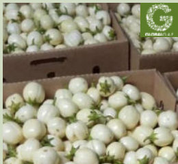
Garden Eggs 7 / 8 kg box