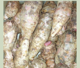
Coco Yam 10 kg box