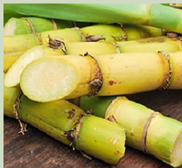
Sugar cane 10 kg box