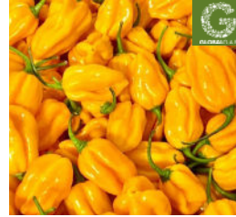
Yellow Habanero 4 / 5 kg box