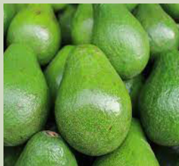
Jumbo Avocado 4 / 10 kg box