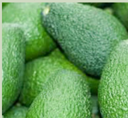
Hass Avocado 4 kg box