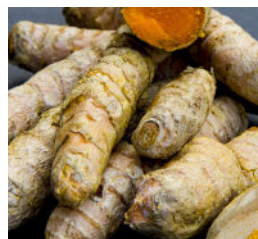
Turmeric 8 kg box

SPICES & NUTS with standard packaging sizes