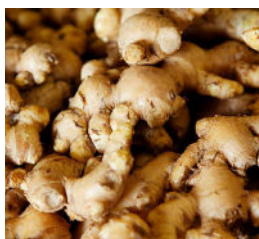
Ginger 8 kg box