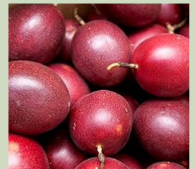
Passion Fruit 4 / 6 kg box