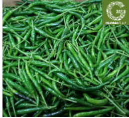
Green Chillies 2 / 5 kg box